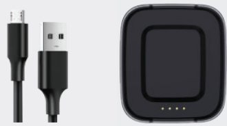
USB charging cable